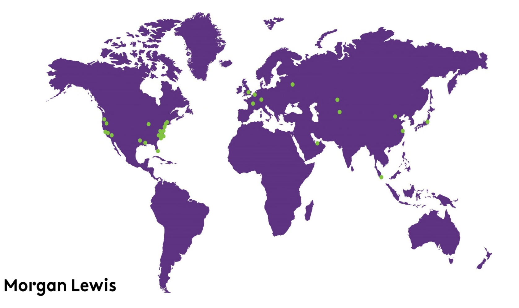
Silicon Valley Singapore Tokyo Washington, DC Wilmington