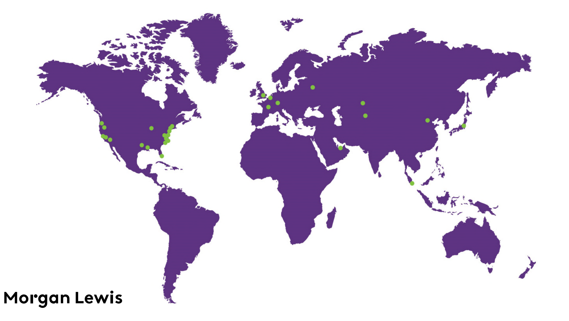
Singapore Tokyo Washington, DC Wilmington